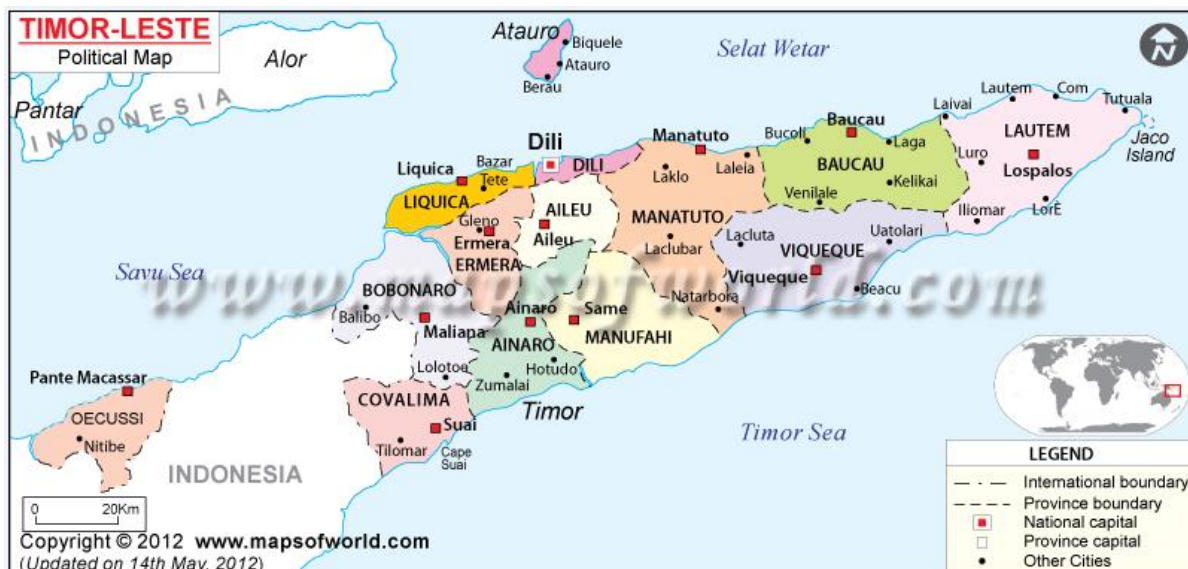
Map of Timor-Leste

Both judicial districts have only one PDO office each in the judicial capitals Baucau and Suai, which means that many of the citizens residing in rural areas cannot afford travelling or have not even heard of or seen public defenders. The geographical barrier compounded by their limited resources also poses a serious challenge to the PDO in making their services widely available.