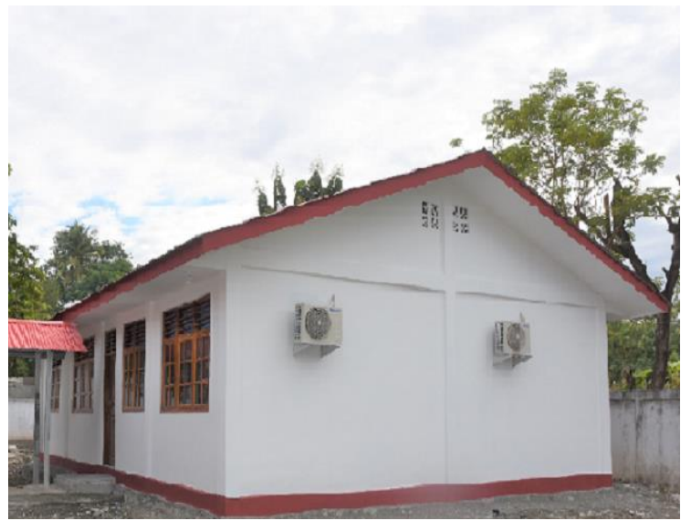
The AJC Office, Suai