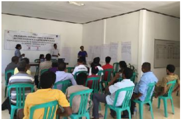
ADR Training, February 2018, Baucau

Advocating the formal justice system does not negate the value and validity of the informal justice system that is prevalent in the country with better accessibility and acceptance. 8 The AJCs, in fact, are well equipped to make linkages between both justice systems. The AJCs' awareness-raising campaigns and ADR training are, in fact, good examples which socialize the remit of the authority of the local leaders in conducting the community-based procedures and assist them to be able to mediate in increased conformity with the Constitution and international human rights standards.