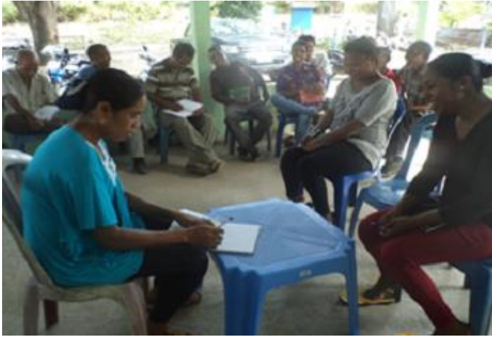
ADR Training, July 2017, Manufahi