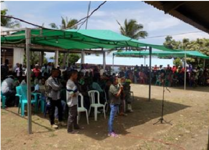
BELUN Outreach Campaign, December 2017, Baucau