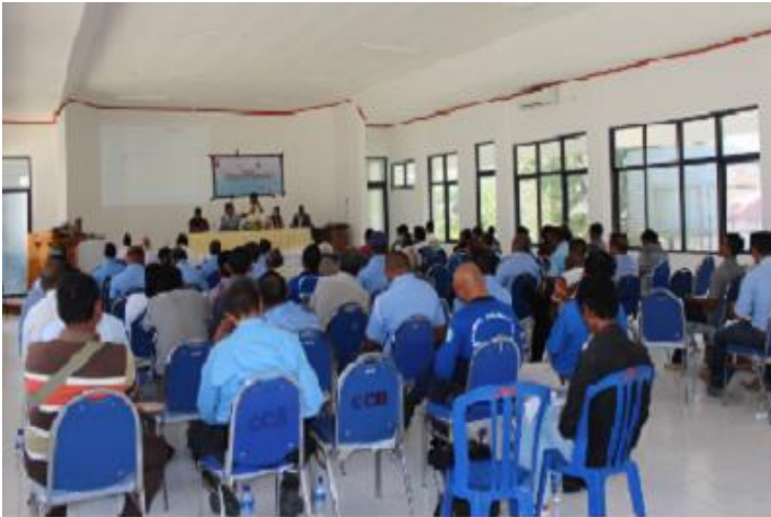
AJC Workshop, August 2017, Baucau

UNDP has conducted its own awareness-raising campaigns to inform of the free legal aid services of the AJCs. The one-day workshops targeted the District Administrators, Sub-District Administrators, Chief of Villages, and Community Policing Officers in 7 Municipalities (Baucau, Suai, Manatuto, Lautem, Ainaro, Manufahi, and Bobonaro), in which a total of 433 people (388 men and 45 women) attended. The workshop received positive feedback from the District Administrators, suco chiefs, and other participants who appreciated the information given in the events and emphasized that the AJCs were one real example to bring justice closer to the communities primarily in the rural area.