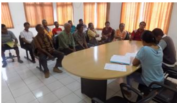
BELUN staff interviewing the disputants of a land dispute for mediation, April 2017, Suai

Belun, one of the partnering CSOs, is specializing in land mediation and has been fully cooperating with the PDO to provide their mediation expertise and services. This partnership has helped the PDO resolve its new and old land cases, many of which were pending due to the lack of human and financial resources. Furthermore, addressing land disputes through the Alternative Dispute Resolution could be an optimal choice in Timor-Leste at this point of time. The civil