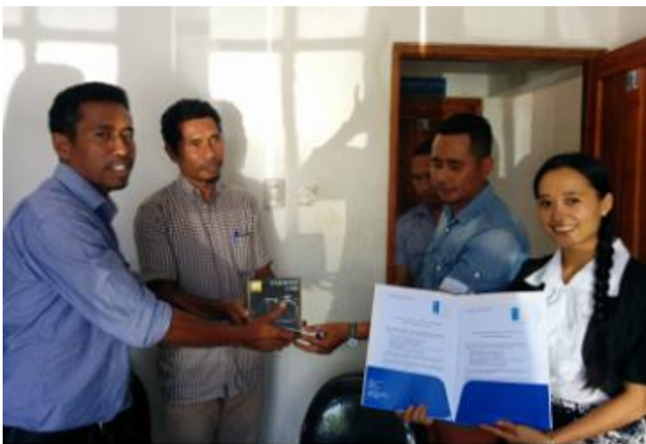
Transfer of asset custody