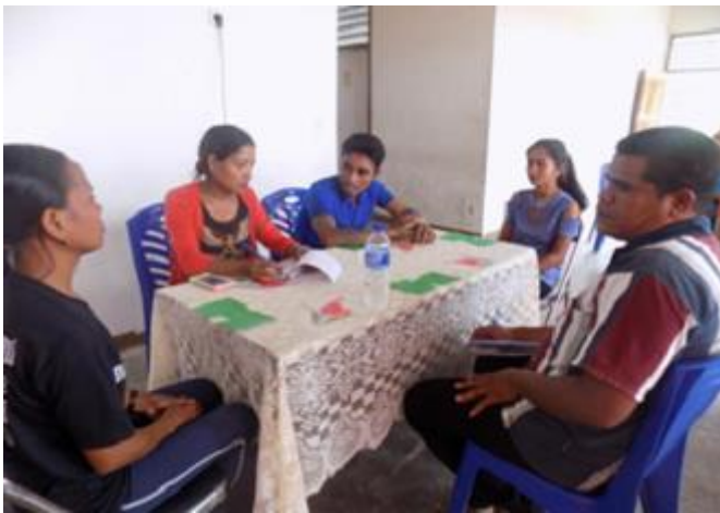
ADR Training, January 2018, Covalima