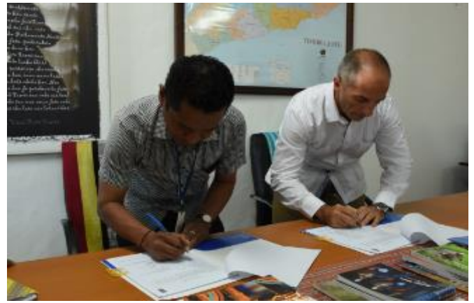
Second signing with BELUN, October 2017