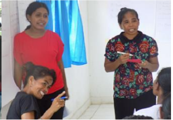
ADR Training, December 2017, Covalima