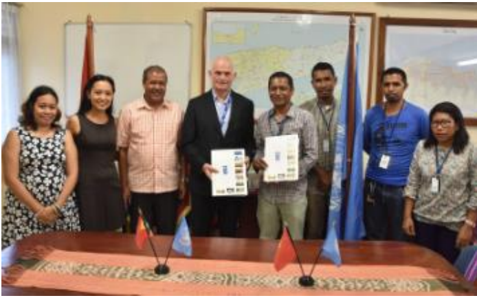
First signing with BELUN, December 2016