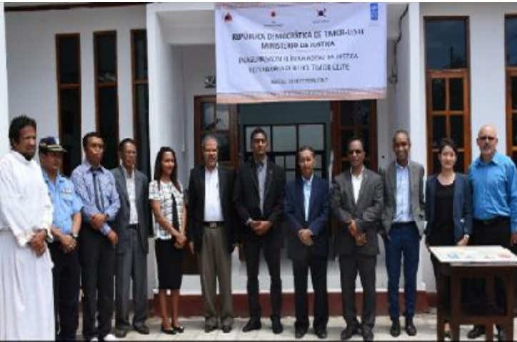
Inauguration Ceremony, Baucau