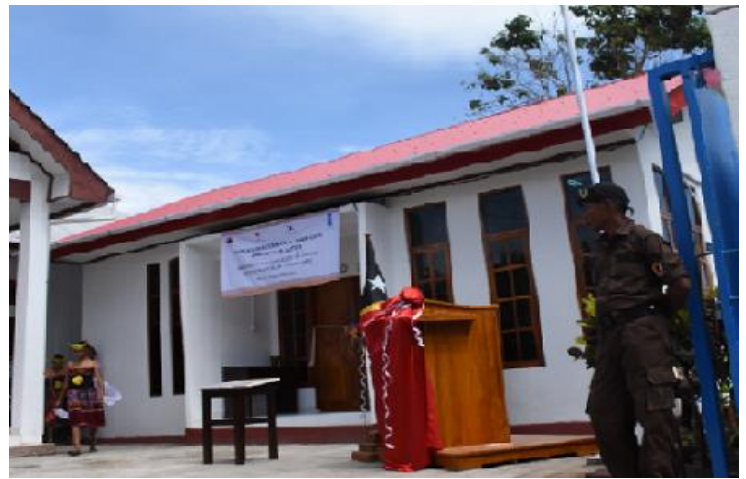
The AJC Office, Baucau