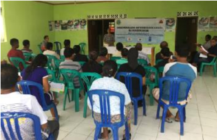
JPC Outreach Campaign, February 2018, Manatuto