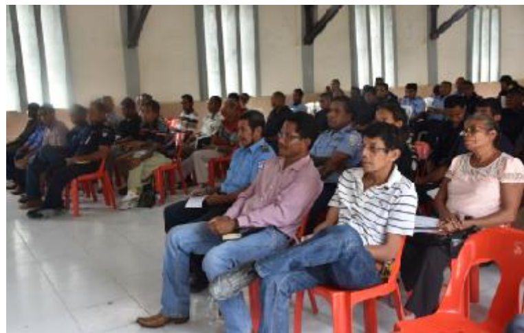
AJC Workshop, January 2018, Viqueque

Belun, in particular, conducted the ADR (especially, mediation) training for suco chiefs and community leaders who have the authority, as per traditional customs, to settle the civil disputes that have arisen in their respective communities. The participants learn about the legal remit of their authority and how to better mediate conflicts. The total 14 training courses, up to February 2018 on the sub-district or suco levels in the Baucau and Suai Judicial Districts, were participated by a total of 269 people (195 men and 74 women), average 98% of whose knowledge on mediation have shown increased according to the pre- and post-tests.