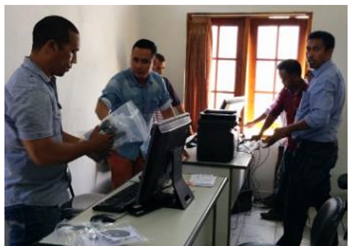
Installation of the assets