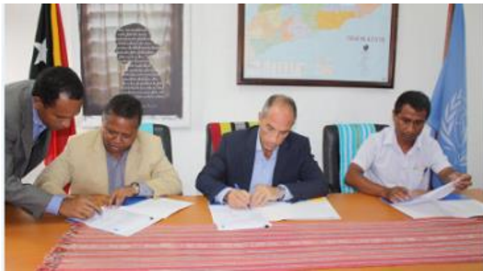
Signing with JPC and JNJ, April 2017