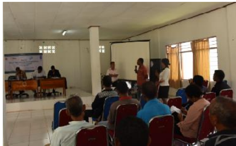
AJC Workshop, October 2017, Manufahi