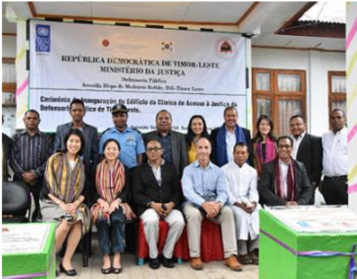
Inauguration Ceremony, Suai