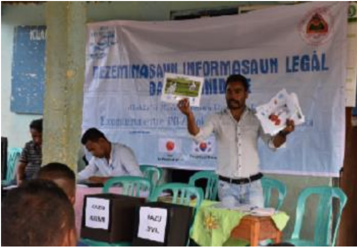
JNJ Outreach Campaign, August 2017, Ainaro