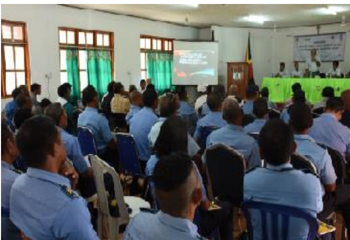
AJC Workshop, November 2017, Lautem